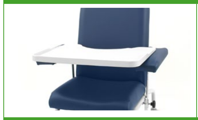
Table 60x47 cm wrap-around recess and folding edges Dx or Sx